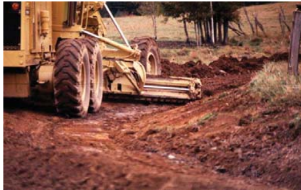
Ditching for Proper Drainage